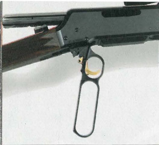
The strength of the BLR's modern action permits the use of higher-intensity loads than traditional tube-magazine lever guns.