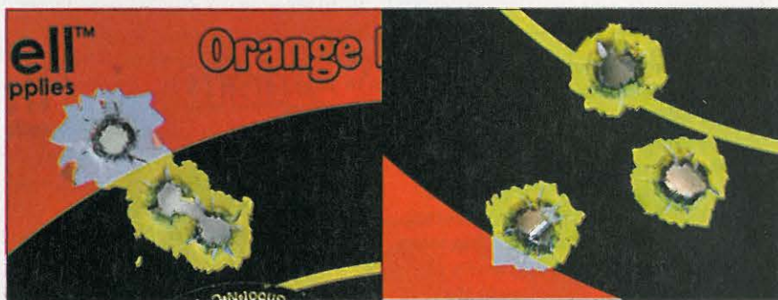
Inherent accuracy: Both Winchester's 200-grain Silvertip (left) and Quality Cartridge's 250-grain Grand Slam offerings delivered excellent 100-yard results.

If the blued version I used is a bit too pretty for your tastes, there's a matte stainless variant. The BLR in .358—in whatever configuration—has been around for long enough to rate status as a classic. It's just as cool as I remember.—Payton Miller G&A