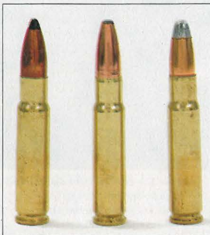
Winchester's 200-grain Silvertip loading (right) is a good one, but 250- (left) and 225-grain (center) loadings can increase the utility of the .358.

putting it back on and shooting another to see if I could discern any shift in point of impact. What I saw was minimal, maybe an inch higher and an inch off windage-wise. If I transported a taken-down BLR to a hunt (either by plane or pickup truck), I'd probably check it before hunting. But I'd do that with a solid-receiver bolt action anyway. And I saw no shift in the BLR's zero that would have any effect on big game out to 150 yards or so.