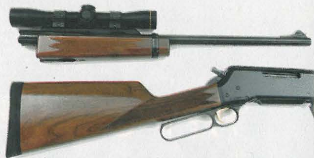
The takedown lever allows instant disassembly, a real plus for situations where storage space is limited.

I fired a series of 100-yard groups and was very pleased to find two stellar performers. Both Quality's 250-grain Grand Slam loads and Winchester's 200-grain Silvertips produced several one-inch groups. In offhand shooting at gongs, I was very im-